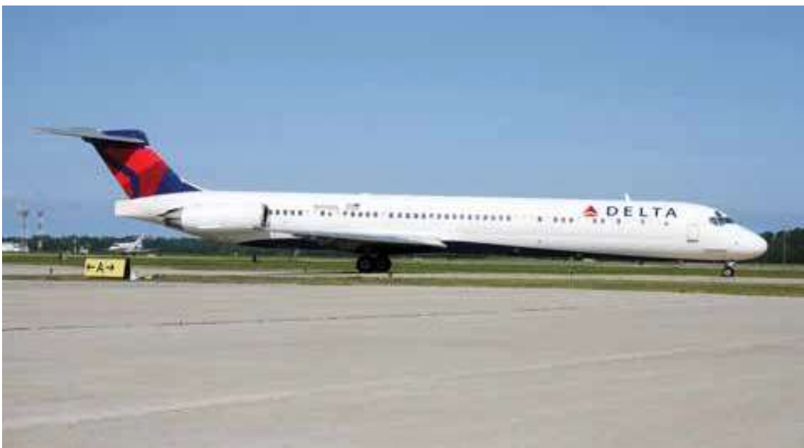
Newport News/Williamsburg International Airport.

Like us on Facebook and X (formerly Twitter).