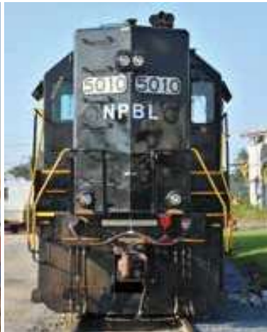
Norfolk & Portsmouth Belt Line.