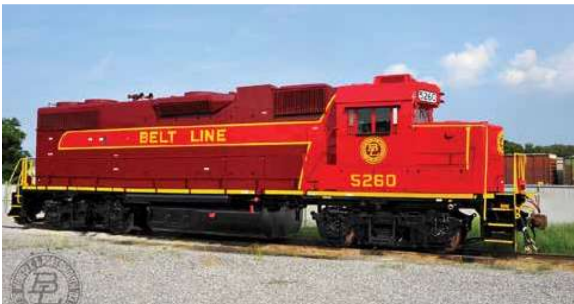
Norfolk and Portsmouth Belt Line.

For more information and a system map of the beltline please visit www.npblrr.com .