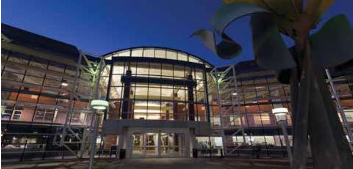
Roanoke-Blacksburg Regional Airport (ROA).

Roanoke-Blacksburg Regional Airport (ROA) is Western Virginia’s only full-service airport. Allegiant, American, Delta, and United provide service to eight destinations, including Atlanta, Charlotte, Chicago, New York City (LGA), Orlando (Sanford), Philadelphia, St. Pete/Clearwater, and Washington, D.C. (Dulles).