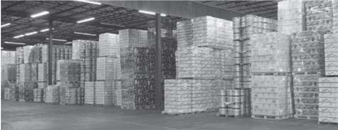
Port Norfolk Commodity Warehouse.