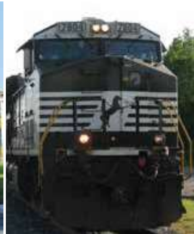
Norfolk Southern Corporation.