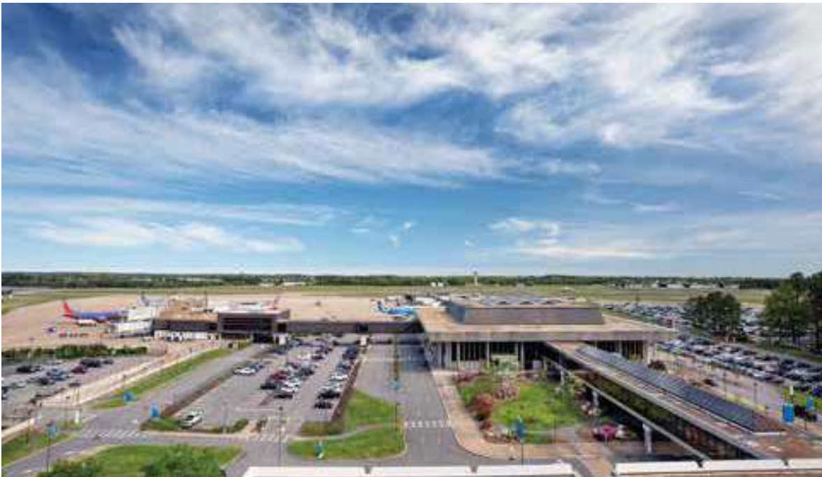
Norfolk International Airport.

Signature Flight Support operates a state-of-the-art general aviation terminal. The fixed base offers a wide range of services and facilities for maintaining and housing private and corporate aircraft. A U.S. Customs clearance facility for international private aircraft arrivals is located adjacent to the FBO terminal.